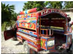
Tap Tap - (Haitian Taxi)

As soon as we got off the plane and started down the dusty and rough road towards Leogone, Haiti, I found myself clicking my heels together and saying, "there's no place like home...there's no place like home".